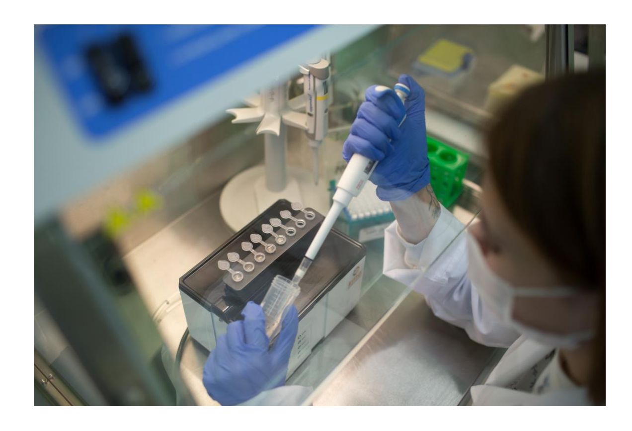
Watch LifeCase on youtube - Click Here...